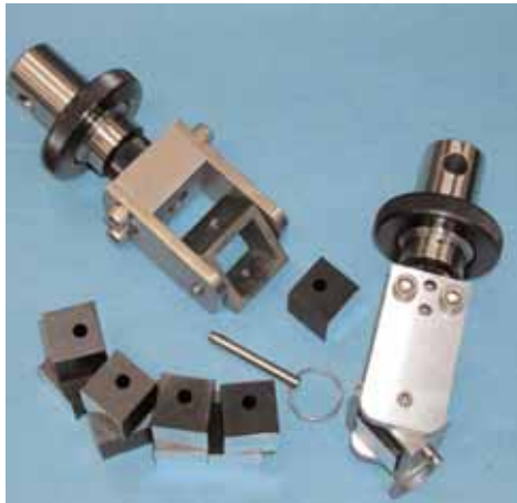
▲ Catalog number 2505-015