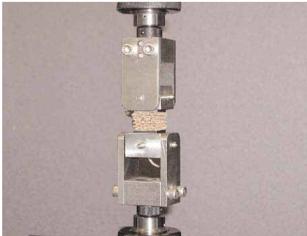
▲ 2505-015 Flatwise tension fixture

This fixture can be used for a variety of core materials such as open cell honeycomb structures as well as continuous core structures such as foam or balsa wood.