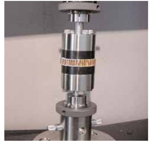
▲ Catalog number 2505-013