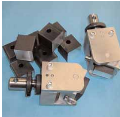
▲ Catalog number 2505-014