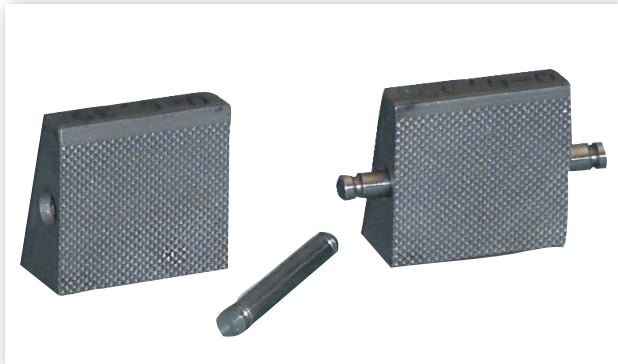
Flat Serrated Jaw Faces

Note: Jaw face catalog number provides four faces Jaw faces are hardened to 48Rc to 52Rc, unless otherwise specified All faces are diamond serrated 45°